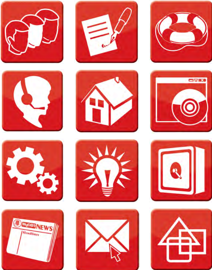
Icons for website